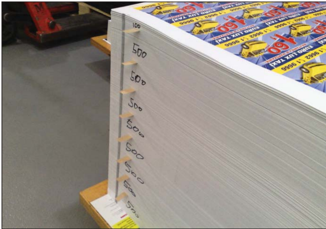
Finished tabbed stack.