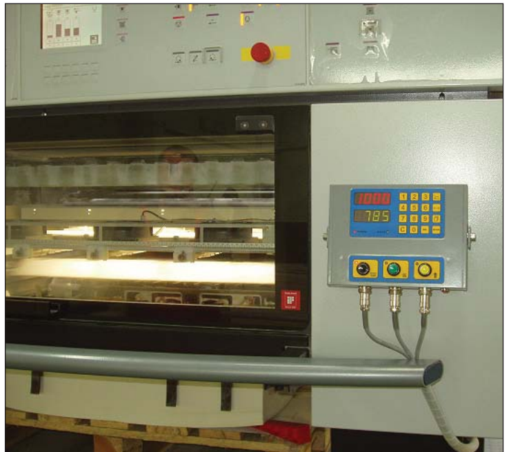
Interface box mounted on press.