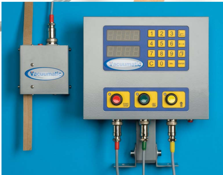
MTI Tab Inserter and interface box.

It has a minus button to allow for any sheets removed from the delivery, cut delay and tab length control along with a total count display.