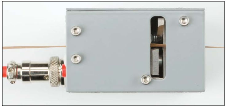
Side view of tab inserter showing cutter position.